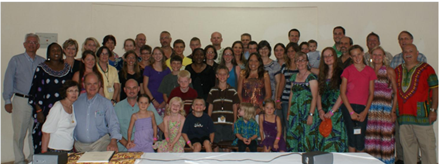
All of the LCMS World Mission missionaries serving in Africa and our Grace Place retreat leaders.