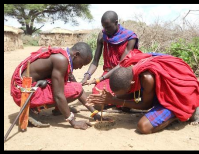
The Maasai use nature to meet their needs. Here the men are showing how to make a fire using sticks and dung.