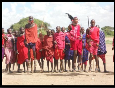
In Kenya we were able to learn more about the Maasai culture. Jumping high is a big part of their traditional dance.